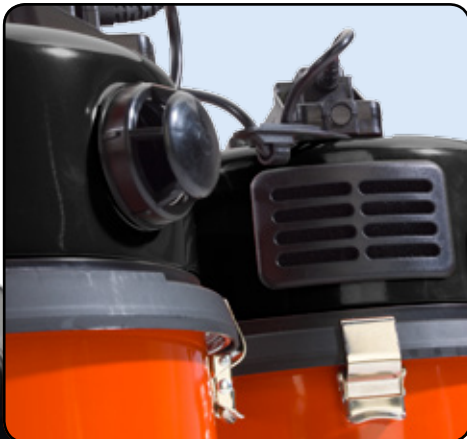
Choice of blower or diffuser system