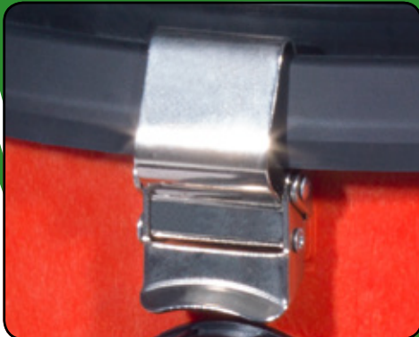
Professional specification throughout