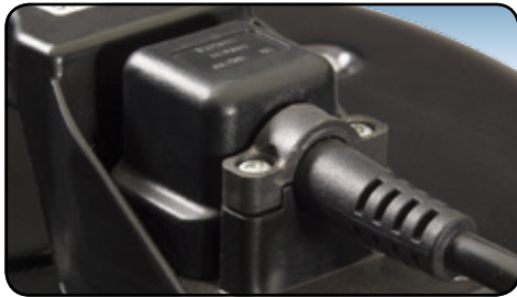
Nucable easy replacement plugged cable system

We learnt from the 250 that the commercial cleaning business was rough and tough but, having said that, the majority of our early machines are still working 20+ years later.