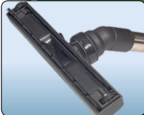
ProFlo heavy duty floor tool